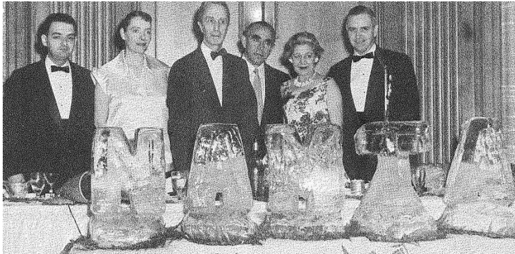
In 1959 Norman Rockwell, center, was Keynote Speaker